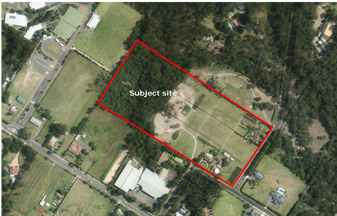
Figure 2 Aerial photograph

Concern is raised regarding a number of matters associated with the proposal, particularly with regard to requirements under SEPP (Housing for Seniors or People with a Disability) 2004 as outlined below.